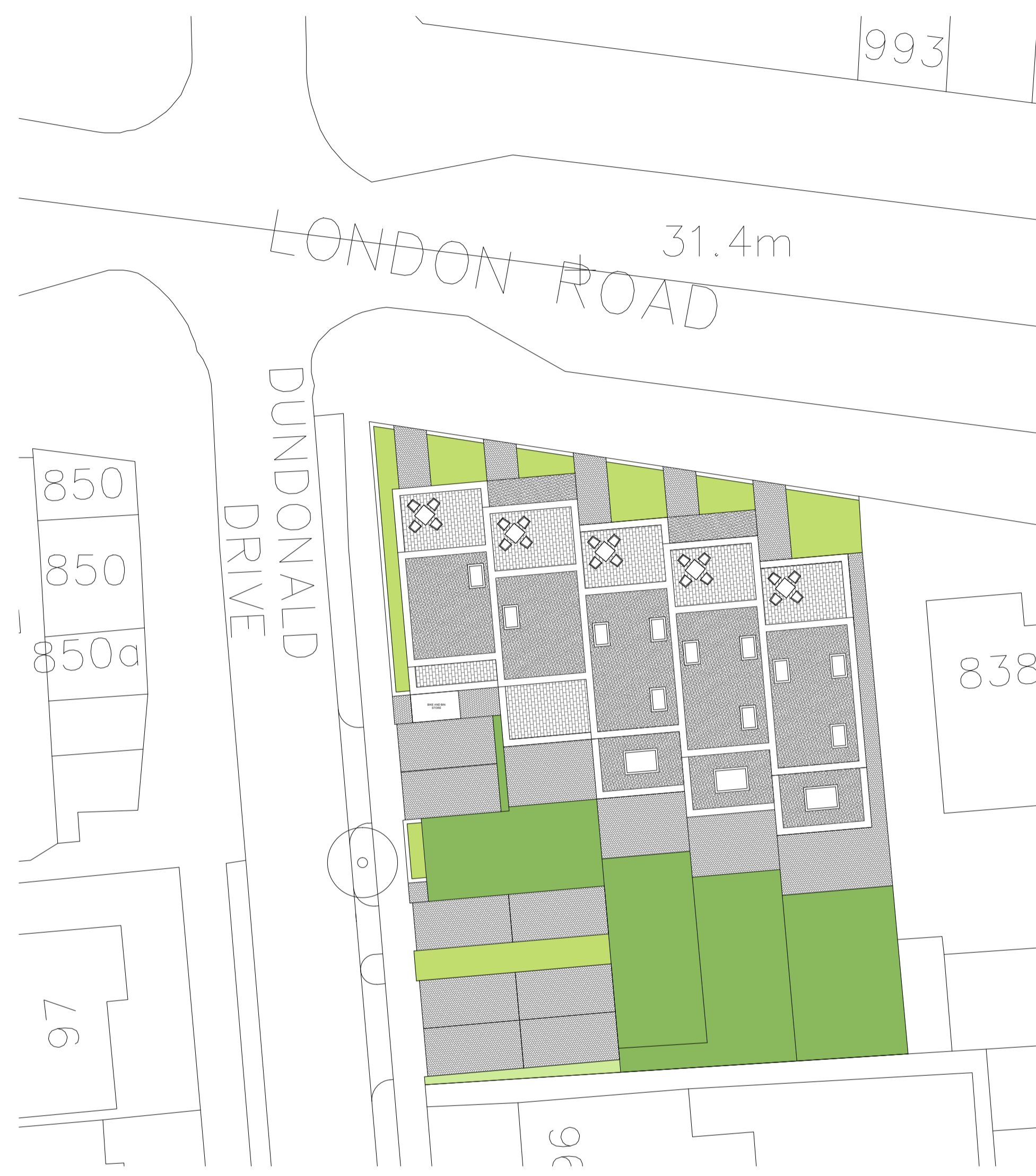
Proposed Block Plan - 1:200